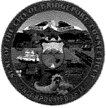
Joseph P. Ganim Mayor