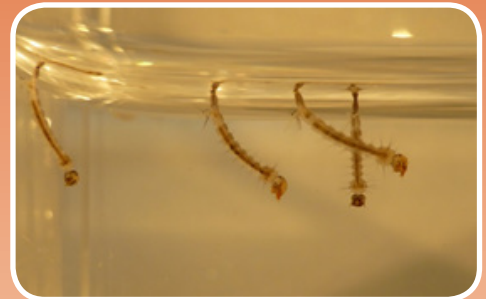
Larvae in the water.