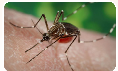
An adult mosquito bites a person.