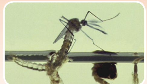
An adult mosquito emerges from a pupae.