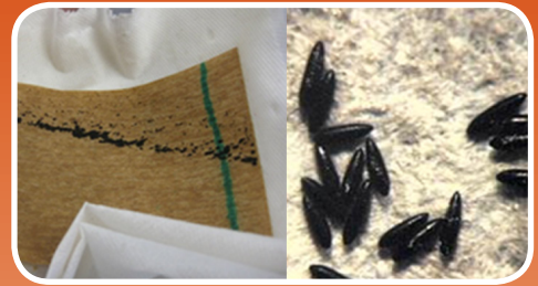
Eggs look like black dirt.